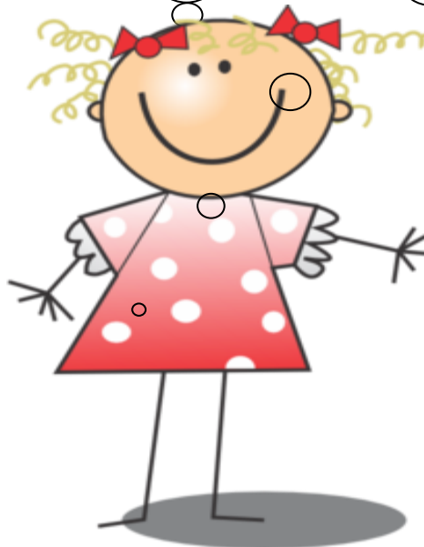
4 - 5; 11 years

I learn these sounds next: by 4 years f k g h y