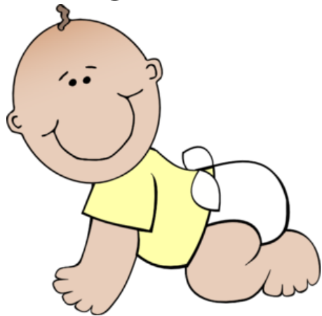
18 months to 3 years

I learn these sounds first: by 3 years t d b m w n p And vowels